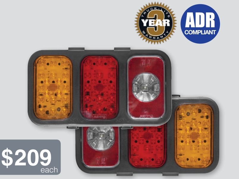
45426TLC - RHS / 45427TLC - LHS