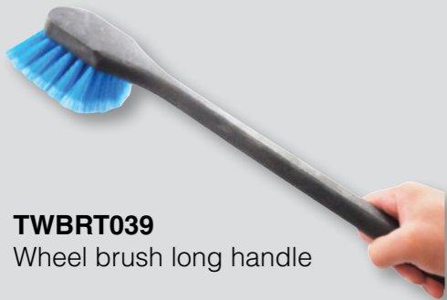
TWBRT039 Wheel brush long handle