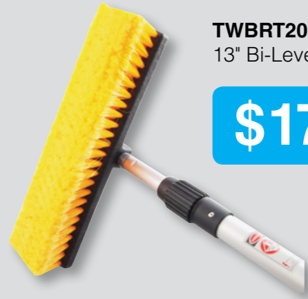
TWBRT208 13" Bi-Level brush head (Green)

Your truck will sparkle like never before with our huge range of cleaning products and accessories.