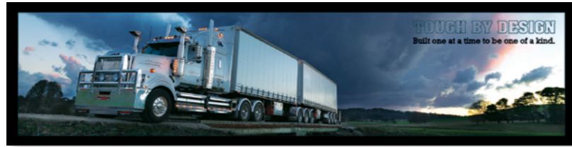
WS1415A Bar Runner

Genuine savings on run-out merchandise lines. First in, best dressed!