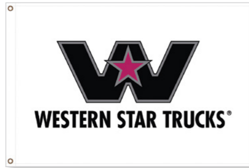
WS1418A Western Star Flag