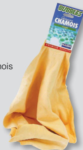
50H Large genuine chamois