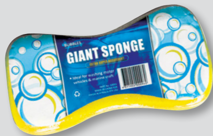
S105S Jumbo sponge