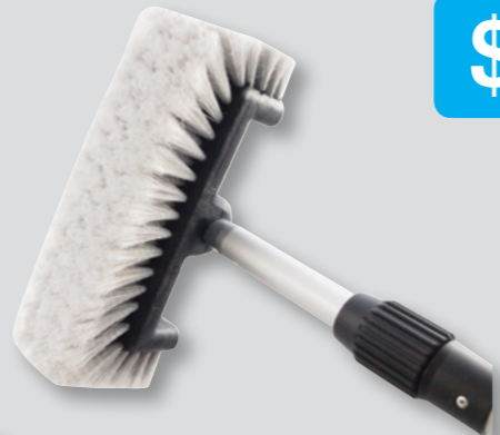
TWBRT116 2.5m No-flow pole